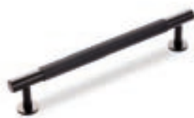
HA275, HA276, HA277