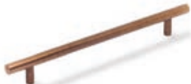
HA156, HA157, HA158