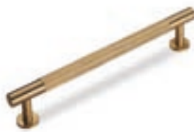
HA257, HA258, HA259