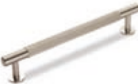
HA287, HA288, HA289