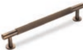
HA269, HA270, HA271