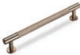
HA263, HA264, HA265