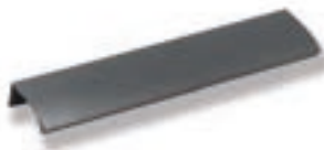
HA201, HA202, HA203