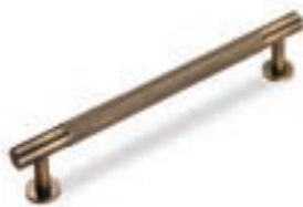
HA245, HA246, HA247