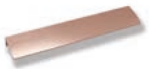
HA240, HA241, HA242