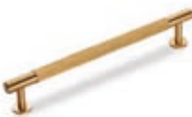
HA281, HA282, HA283