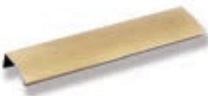
HA204, HA205, HA206