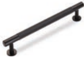
HA251, HA252, HA253