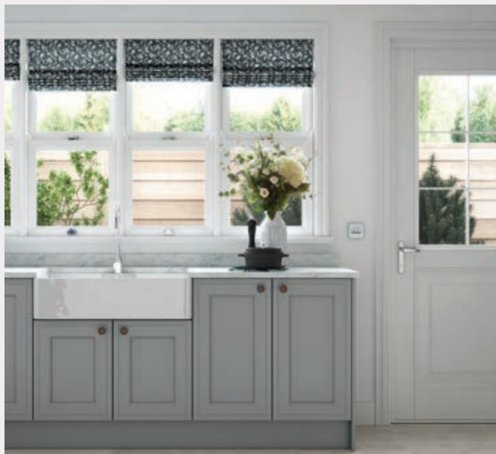
A Silestone Eternal Statuario worktop combines beautifully with the Light Grey run of cabinets. American Copper knob and cup handles are a rustic finishing touch.